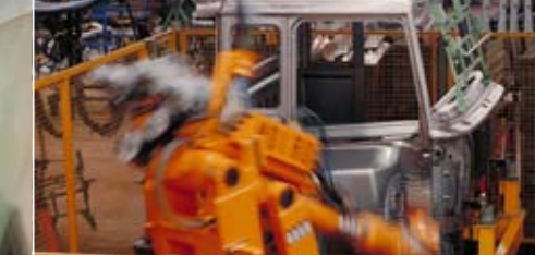
B-SX6 & B-SX8