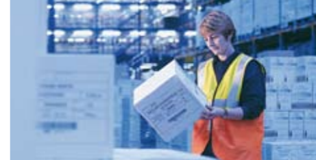
B-SX4 & B-SX5