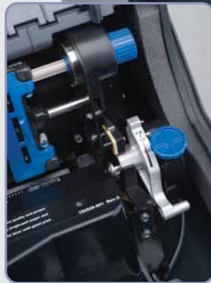
Platen adjustment feature