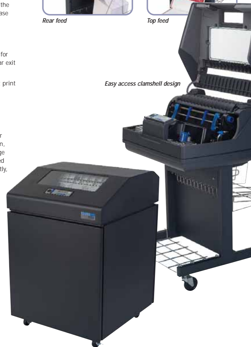
Enclosed cabinet design

The enclosed cabinet models provide for near silent operation, making these printers perfectly suitable for use in the quietest of office environments. In addition, these models provide the best paper handling for large print runs. All input paper is sealed inside and protected from bumping and contamination. Even more importantly, an elegantly simple, but highly effective combination of moveable fences and chains allows for neat stacking all the way up to a full box of paper. For tougher forms that tend not to refold well, a SureStak power stacker option is available for the enclosed cabinet models. With this option, even the toughest forms can be printed and stacked neatly up to a full box. So, in either configuration, the enclosed cabinet models are your best choice for large unattended production printing applications.