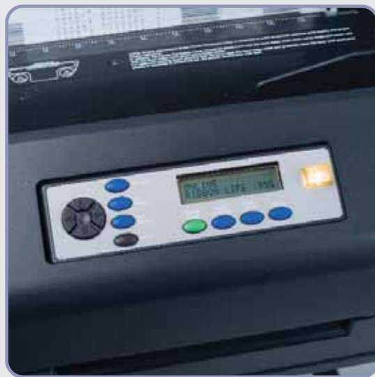
Plan print jobs with precise ribbon life indicated on panel

Special formulation and larger capacity spool delivers higher performance and lower cost