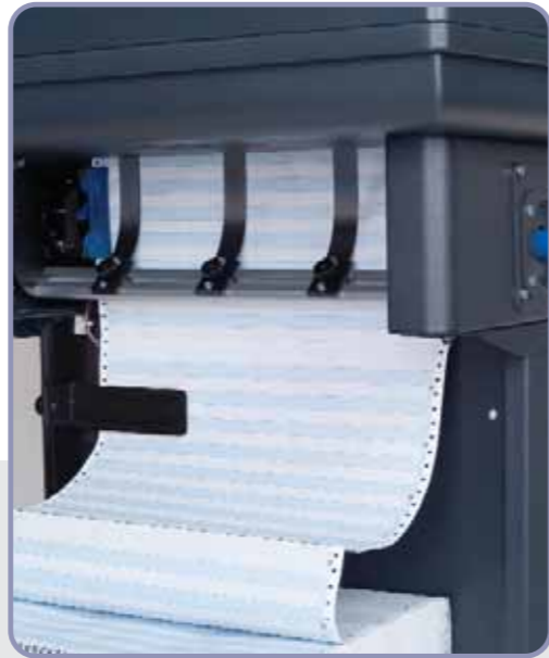
Push tractor system eliminates forms loss

The smart paper system automatically ejects the paper for tear off after the page or job is printed, and then retracts it as soon as the next job is sent. Or, at any time, you can use the Eject key to present or return forms as necessary for tear off.