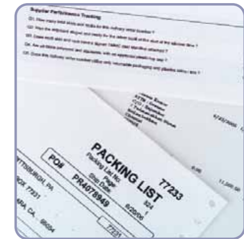
Sharp image quality