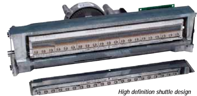
High definition shuttle design

The nominal print density for the P7000HD series is 180 x 180 dots per inch (DPI). Alternately, 180 x 120 and 120 x 120 DPI modes are available for applications where the emphasis is more on speed rather than image detail. Whichever model you choose, the Printronix P7000HD has the power to print graphics and complex forms with sharper quality than any other impact printer technology available.