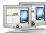
MobiControl Management Console(s)